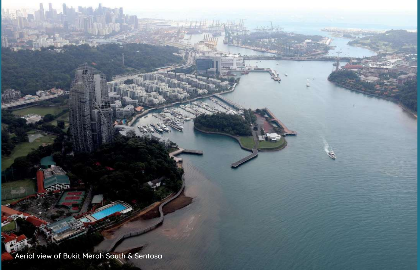
Aerial view of Bukit Merah South & Sentosa

Our towns are planned to be liveable and self-sufficient, with easily accessible shops, health care, schools, community facilities and parks. Commercial nodes, industrial estates and business parks within or nearby the town, also help to provide nearer job opportunities for residents. The detailed planning and implementation of plans for each town is a joint effort of many government agencies.